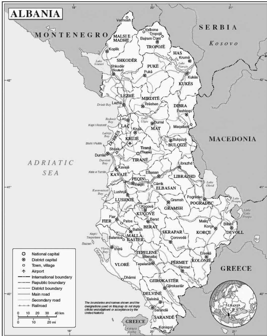
Fig. 1: Administrative map of Albania modified from a map offered by the NATO at http://www.afsouth.nato.int/NHQT/Factsheets/Factsheet_map.htm (downloaded 24 April 2007).