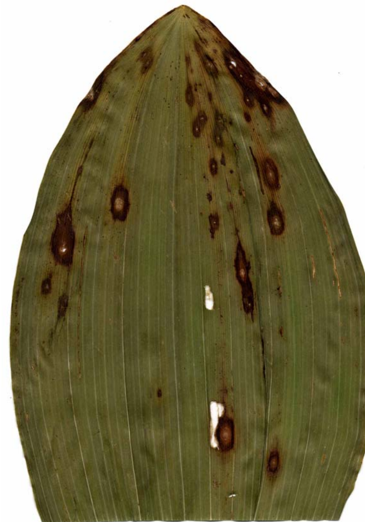
Fig. 1. Leaf of Veratrum album with lesions caused by Colletogloeum veratri-albi.