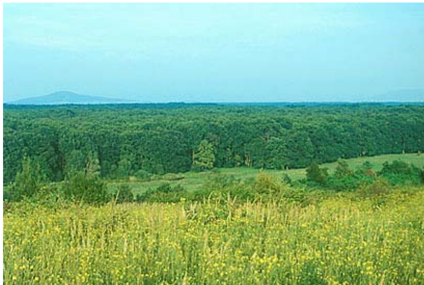
Fig. 7: Riverine forest dominated by Fraxinus angustifolia and Quercus robur along Borshava river near the village of Kvasovo.

Shrub layer: height: 1-10 (12) m, cover: 20 %