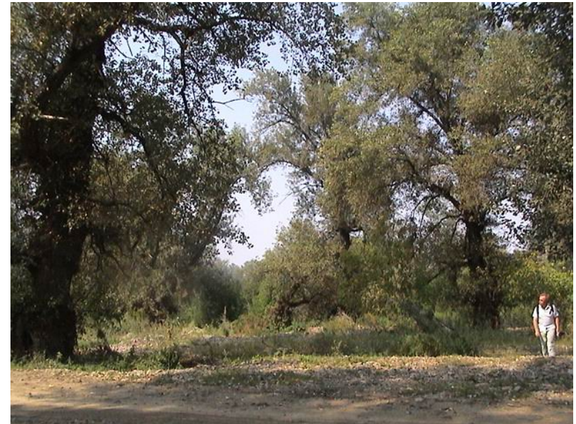
Fig. 6: Heavily grazed Populus nigra stands in the floodplain of Tisza river near the town of Vinogradiv (site no 11).

Achillea millefolium agg. Ambrosia artemisifolia Anchusa officinalis Arctium cf. lappa Aristolochia clematidis Artemisia absinthium Centaurea arenaria subsp. borysthonica Xanthium strumarium Centaurea jacea agg. Chaenarrhinum minus Chenopodium album Chenopodium botrys Chenopodium schraderanum Cirsium arvense Clematis vitalba Cynoglossum officinale Daucus carota Digitaria ischaemum Dipascus fullonum Echinochloa crus-galli Elsholtzia ciliata Erigeron annuus Erodium cicutarium Eryngium planum Eupatorium cannabinum Euphorbia cyparissias Helianthus tuberosus Leontodon hispidus Lepidium ruderale Lythrum salicaria Medicago sativa agg. Mentha longifolia Odontites vernus Ononis spinosa Plantago lanceolata Populus nigra (seedlings) Prunella vulgaris Fallopia japonica Rosa canina agg. Rubus caesius Sambucus ebulus Setaria pumila Solidago gigantea Tanacetum vulgare Tussilago farfara Urtica dioica Verbascum phlomoides Verbena officinalis