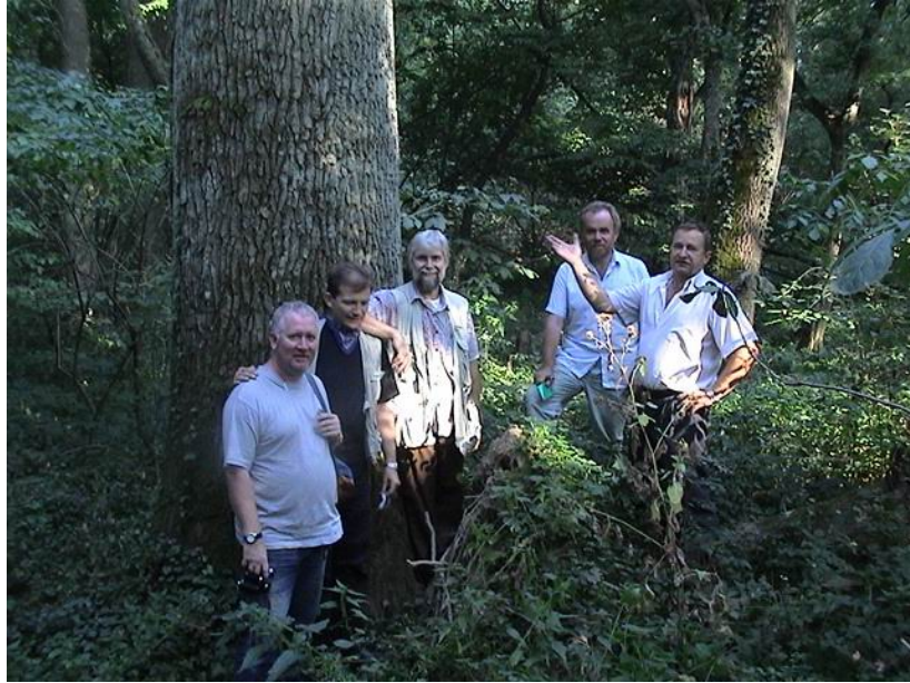
Fig. 8: The old growth forest of the 'Atak' Local Forest Reserve near the village of Velyki Berehy (site no 12). The authors together with local forester and volunteer.

SITE 13: UKRAINE , Transcarpathia, Beregovo Rayon [county], 2 km linear distance W of Dyida; 48°12.941'N/22°32.559'; 128 m a.s.l.