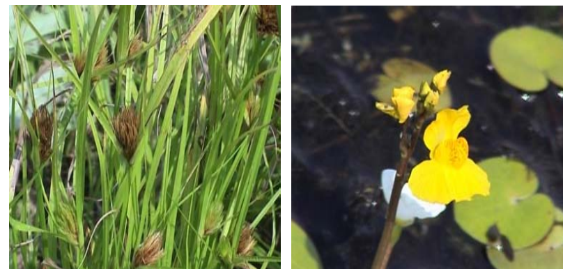
Fig. 9a (left): Carex bohemica in the pond near the village of Dyida (site no 13). - 9b (right): Utricularia australis in the pond near Dyida