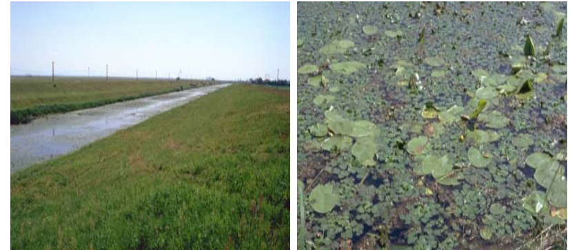
Fig. 2a (left): Drainage channel in the Trancarpathian Plain near the village of Chervone (site no 7). - 2b (right): Trapaetum natantis in the drainage channel near Chervone village.

Agrimonia eupatoria Althaea officinalis (gully) Carex hirta Carex riparia (gully) Cirsium canum Dipsacus laciniatus Eryngium planum Festuca rupicola Festuca valesiaca Galega officinalis Inula britannica Juncus effusus (gully) Potentilla neglecta Tanacetum vulgare Tragopogon orientalis